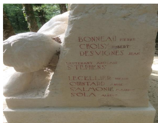
(side view of Verrieres Memorial)