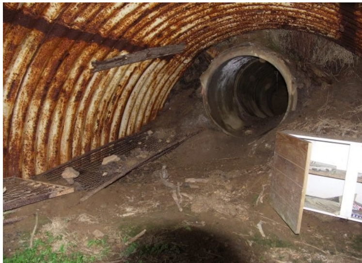
Inside the Grange Patrol Operational Base