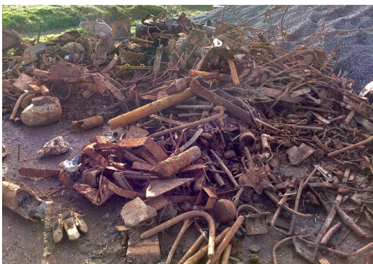
Photo above, in top left corner, shows flare carcasses. These were used by aircraft crews with wounded on board to give them priority landing.

Above left, more items that were found including ,shuttering pins, in the foreground.