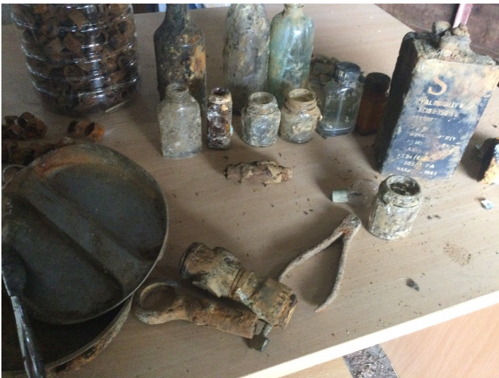
Above, some of the intact bottles that were found besides the hardstandings, possibly for aspirin or aftershave.

It seems that pits were dug beside the hardstands where the B17s were parked and repaired, so that small pieces of wreckage and shells could be easily discarded. These pits gave us an interesting glimpse into activities on the base. We found lots of small pieces of aircraft aluminium, broken pipes, small accumulator type batteries and even an engine cylinder valve complete with its coil spring attached. Larger items buried included two old lorry tyres and a tangled section of heavy-duty security fencing. Regrettably, no major parts from a B17 were found. That site, where many large pieces of equipment were buried after the war, is not available for excavation; it sits under a conservation pine tree plantation on our neighbour's part of the airfield and its treasures will remain hidden.