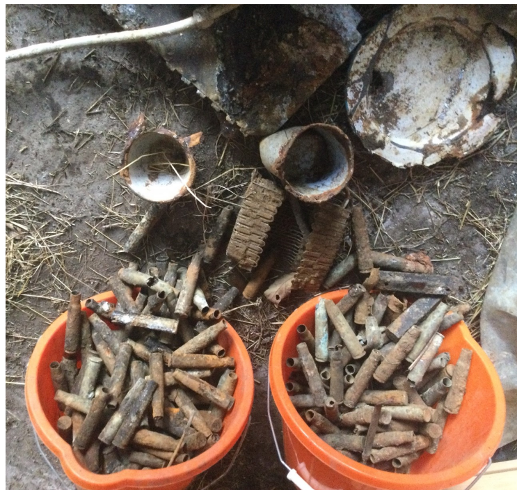
Above, front 100s of empty 50 cal. shells. Live ones had to be disposed of officially. To the rear of the photo you can see an old mess tin and mug.