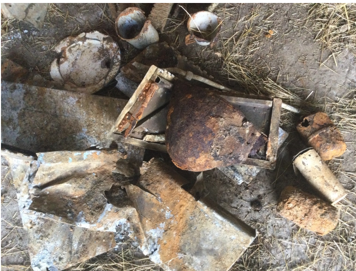
On the casing of each shell there is a code. Most seem to be 5L 43 but there are also M 43 , 5M 43, 5K 43.