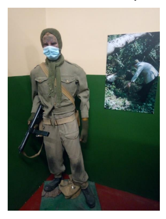
Our Auxilier is Covid-safe